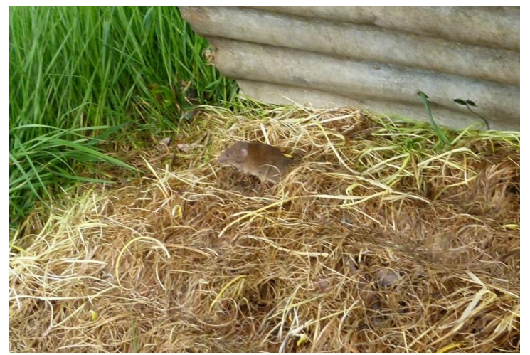
Dawn Chorus on the Pasture

Hopefully we'll have some infrared photos for the next edition. Also we have a monitoring tube set up for nitrous oxide at the Pasture as London's air quality is much in the news nowadays; & reducing pollution levels is being looked at seriously by government. We should have the results in a month or so. Below; a bank vole seen in April.