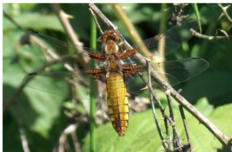
Broad bodied chase dragonfly

Notable bird records include 24 redwings seen on 14 January, blackcaps and whitethroats returning once again to nest (and a blackcap stayed on through the winter), and flocks of more than 200 starlings in October. A moth trap was run over three separate nights adding 16 new species to our record list. We were excited to discover a number of exotic looking wasp spiders. Field voles and foxes are regularly seen.